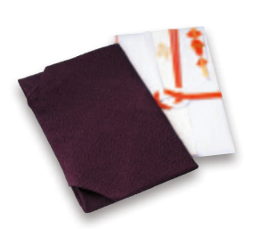
Fukusa and monetary envelope for a wedding