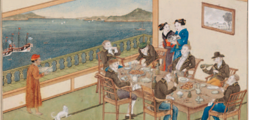
Early 19th-century scroll depicting a banquet, with views of the Dutch Factory and Chinese Quarter in Nagasaki. Torankan-emaki, rankan-zu emaki-zu by Kawahara Keiga.

very little influence of French and German cooking.