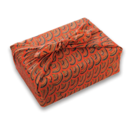
Popular way to wrap

Furoshiki come in many colors and patterns, some with the family crest. Furoshiki are ideal for wrapping objects of different shapes and sizes, and so are perfect replacements for paper giftwrapping. After unwrapping the gift, the furoshiki is taken home by the giver. These days, this handy cloth has aroused a new appreciation, thanks to its ecological aspect, as it can be reused time and again.