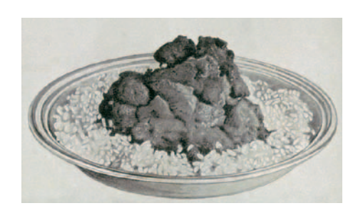
Illustration of curry with rice from Beeton's Book of Household Management.