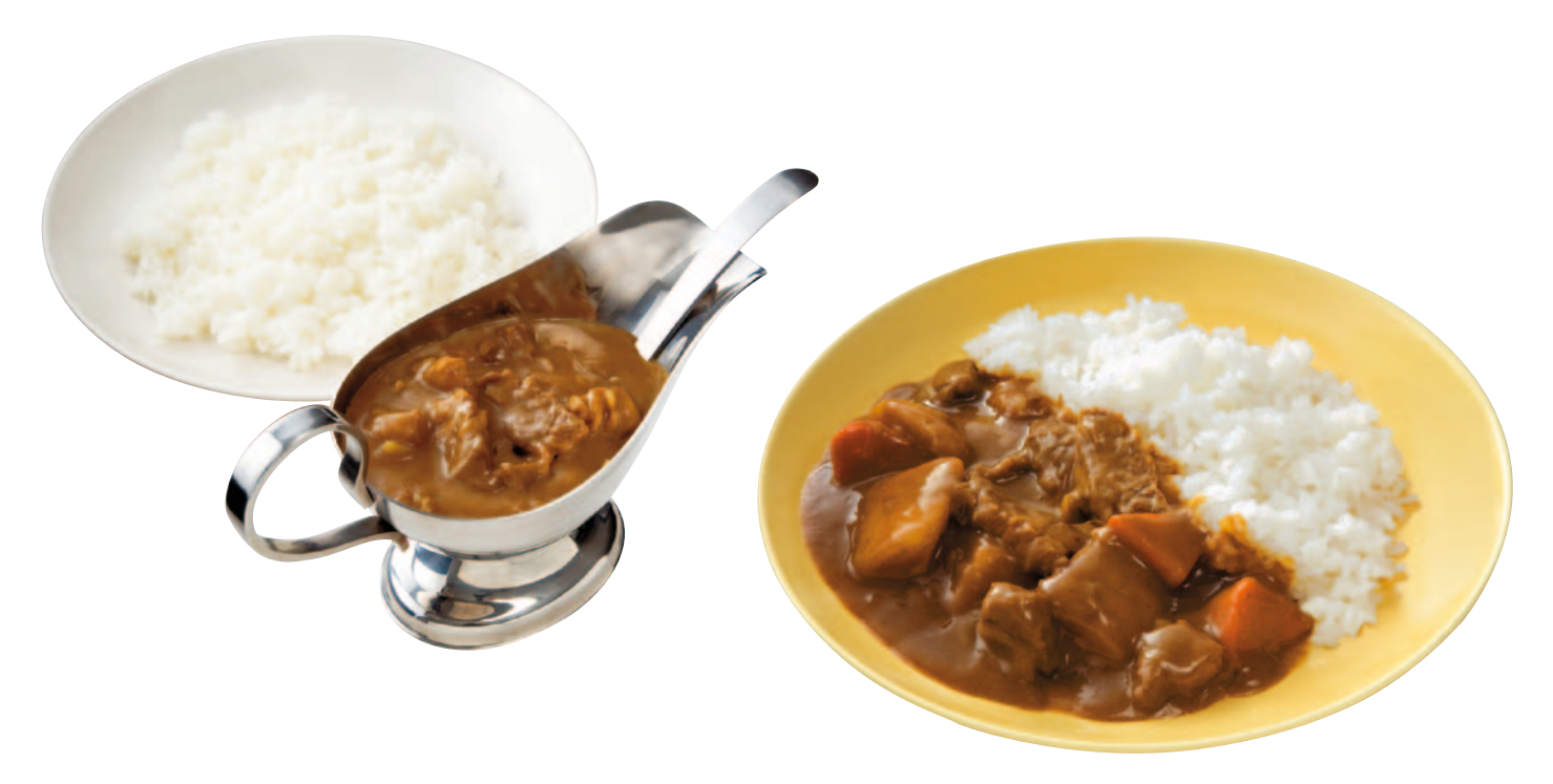
Curry sauce may be served separately in a gravy boat (left), or poured partially over rice, as shown at right