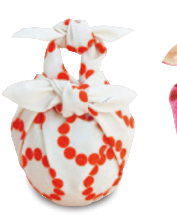
Watermelon (left) and wine bottle wrapped in furoshiki