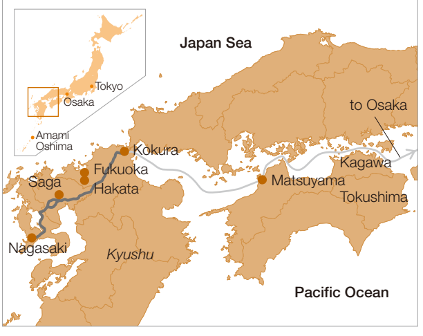
Japan's "Sugar Road"

When missionaries from Portugal and Spain began coming to Japan in the late-sixteenth century, they introduced nanban-gashi sweets, including konpeito (Portuguese: confeito ) and kasutera (castella sponge cake). When Nagasaki port opened to trade in 1571, some 100 kilograms or more of sugar began