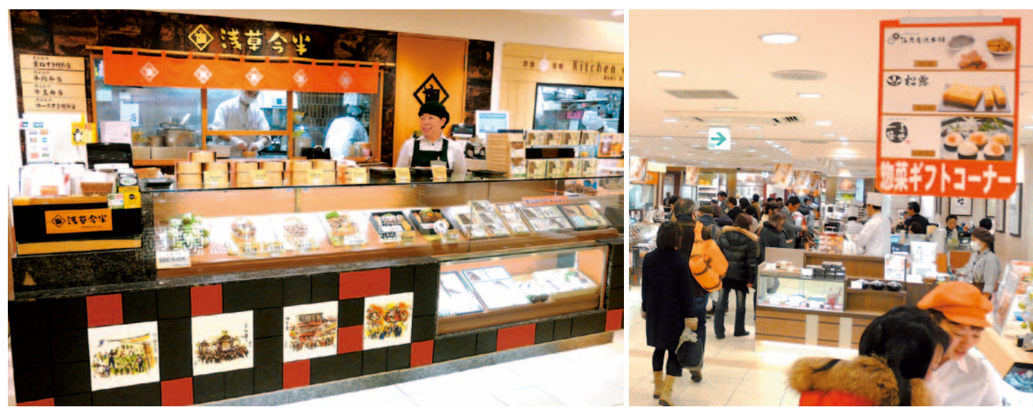
Tokyo Station's GRANSTA shopping arcade offers a variety of foods including bento lunchboxes and prepared dishes.