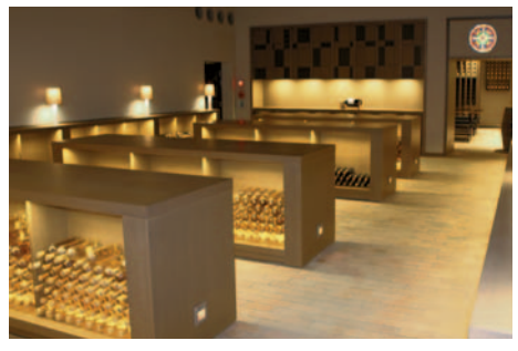
Underground wine cellar

Situated within Bansuien, the winery's authentic Japanese tearoom (chashitsu) and its underground wine cellar, both used to welcome special guests, were recently renovated. The winery updated the tearoom while still retaining much of its original appearance and provided chairs and tables to accommodate those guests unaccustomed to sitting with folded