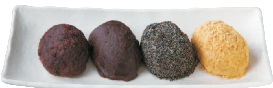
Ohagi and botamochi coatings include (from left): tsubuan, koshian, sugared ground sesame and sugared roasted soy flour.

Ohagi and botamochi consist of steamed glutinous rice that has been pounded until only half the grains remain, then hand-formed into round balls before being coated in thick, sweet azuki red bean paste. Various types of azuki paste may be used, including chunky sweet tsubuan, as well as strained koshian paste; other coatings include kinako,