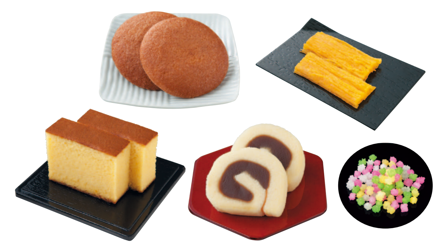
Clockwise from top left: maruboro, keiran somen, konpeito, taruto and kasutera