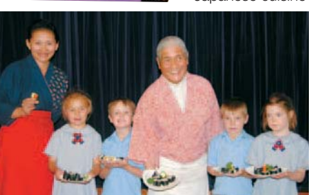
Making sushi rolls at a primary school class (2013)

technology as well. Today considerable progress has been made with logistics, and as changes have been made, we've seen a greater awareness and appreciation of the freshness and quality of fish in various fields of food culture in Australia. Compared to four decades ago, the variety of Japanese food products available has increased as well. Since the early 1980s, many more companies are importing food from Japan, and locally grown and produced rice, green tea and sake can also be found. With the support of the Japanese government, organizations of food producers from Japan often visit Sydney to promote their products, and this increased activity is sure to bring further opportunities in Australia. In Sydney, we also see Japanese food products made in other Asian countries on the shelves, but I believe shoppers are becoming more aware and will come to understand how to select truly genuine products.