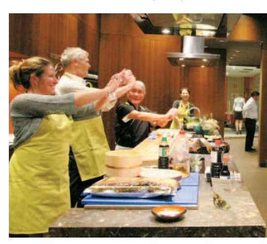
Book launch event at Sydney Seafood School (2010)

In 1990, I started to teach "Sushi & Sashimi" classes at the Sydney