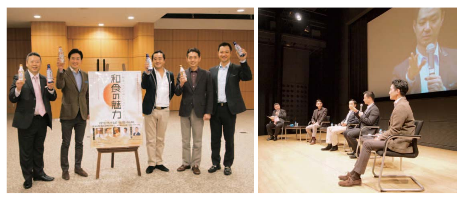
Clockwise from top: Cooking class; Kikkoman's washoku panel discussion; panel coordinator (left) and four participating chefs.

Kikkoman aims to contribute to a greater awareness of washoku and encourage its role in daily life. By creating delicious dishes through encounters with other food cultures, Kikkoman continues to advance a clearer understanding of this healthy dietary approach and its relevance to our lives, our times and our cultures.