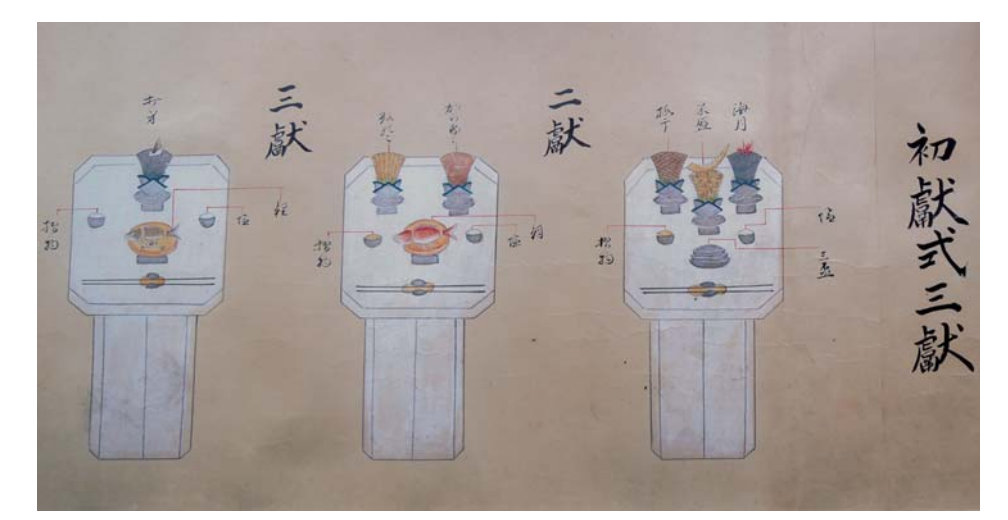
Shiki-san-kon, as depicted in Gyouko-onari-no-gozenbu, a 17th-century illustration that portrays three trays holding sake and food such as rice, seafood, salt and condiments. Together, these comprise the "three rounds" served to guests. The three cups are stacked on the tray at right.

seen today in those festivities held at shrines immediately following a ceremony. Sake that has been offered to the gods is taken down from the altar and distributed among the organizers of the ceremony. Thus naorai refers, in the strict sense, to the sharing or union with the gods to be felt in partaking of the very drink "sipped" by those gods. The procedures or ceremonies of the sake rite are not necessarily standardized, but one well-known formal procedure is the shiki-san-kon or "three formal rounds." This stems from the term shikikon , the formal partaking of sake, in which shiki signifies ritual, while kon refers to sake and an accompanying bit of food. In the shiki-san-kon ceremony, guests receive