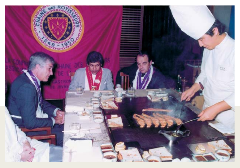
Cooking for judges from Chaîne des Rôtisseurs during the test to become a member

a new financial backer appeared, and that cleared up our financial concerns.