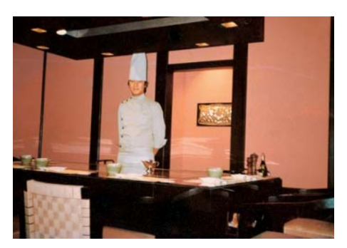
At the teppanyaki counter in Teppanyaki Restaurant Okahan

I went to Teppanyaki Restaurant Okahan as assistant master chef. Later I became head chef, then restaurant manager. Teppanyaki Restaurant Okahan not only served teppanyaki , but also sukiyaki, shabushabu, udon-suki and sashimi. One thing that surprised me about