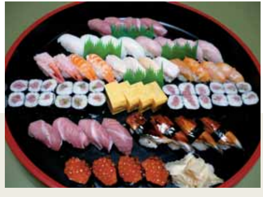
Nigiri-zushi as served at Restaurant KIKAKU

KIKAKU Sushi Lounge at Düsseldorf airport