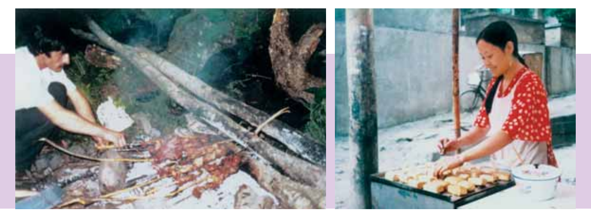
From left: Shish kebab, a common meat dish in the Caucasus; Grilled tofu stand in Guizhou, China

According to World Health Organization (WHO) statistics, Japanese women, who live to an average age of 87, currently hold the top spot in the world in terms of longevity. Japanese men, too, have moved into the lead, with an average age of 80. The average lifespan for both men and women, at 84, is the highest in the world.