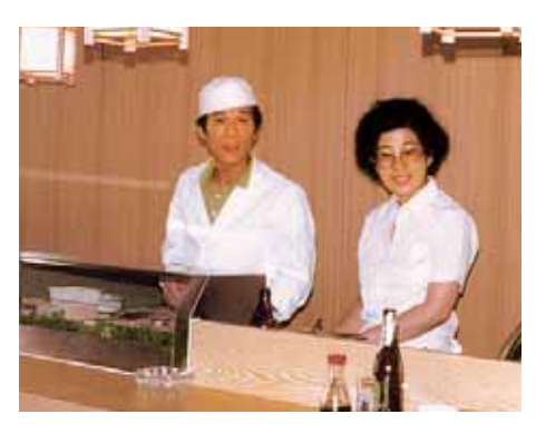
Opening of Restaurant KIKAKU (1977)

We had great difficulty getting ingredients in the early days of the restaurant. We could not import rice from Japan, and when we cooked locally bought rice, it wasn't sticky enough. We had no wasabi either, and had to make do with horseradish. For fresh fish, we would go to Hamburg, the closest German city on the sea. We could get cod, herring and flounder, but that was not enough for a good array of sushi, so we would go to Rotterdam or to Ostend port in Belgium. After a while, we began to drive about once a week to the Paris fish market as well, where they sold plenty of fish and seafood from the Mediterranean. In the beginning, we brought in our own nori dried seaweed, soy sauce, sake and other items by container shipment from Japan; later, things got easier when we began to purchase them