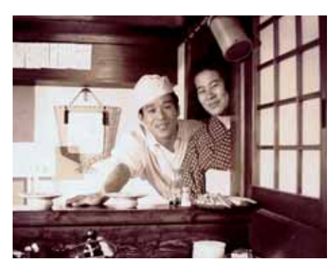
The sushi counter at Nippon-Kan (1964)

The Nippon-Kan restaurant was established in Düsseldorf in 1964, under the auspices of the Japanese government and the support of several Japanese corporations. The restaurant was envisaged as a project to introduce Japanese culture to Germany, and as a center of friendship and exchange. Nippon-Kan was Germany's very first Japanese restaurant: the first floor featured zashiki (a tatami room), a tea ceremony room, a tempura counter, table seating and a courtyard garden. My workplace, the sushi section with counter and tables, was in the basement. There were about 600 Japanese living in Düsseldorf at the time, mostly men posted overseas without their families. Our clientele consisted mainly of these men and the business people they brought in to entertain. At first, Germans would mostly eat tempura or sukiyaki, and try one or two single pieces of sushi afterwards, as they were