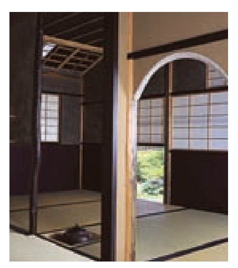
A Japanese-style garden is visible through the small nijiri-guchi entrance of the tea room.

Next, to complement the tea ceremony, a special kaiseki ryori meal is served which features fresh seasonal fish and vegetables. Accompanied by sake, the meal basically comprises soup, a mukozuke side dish, a nimono simmered dish and a yakimono grilled dish. The food is delicately arranged in harmony with the ware upon which it is served, and laid out on individual trays called