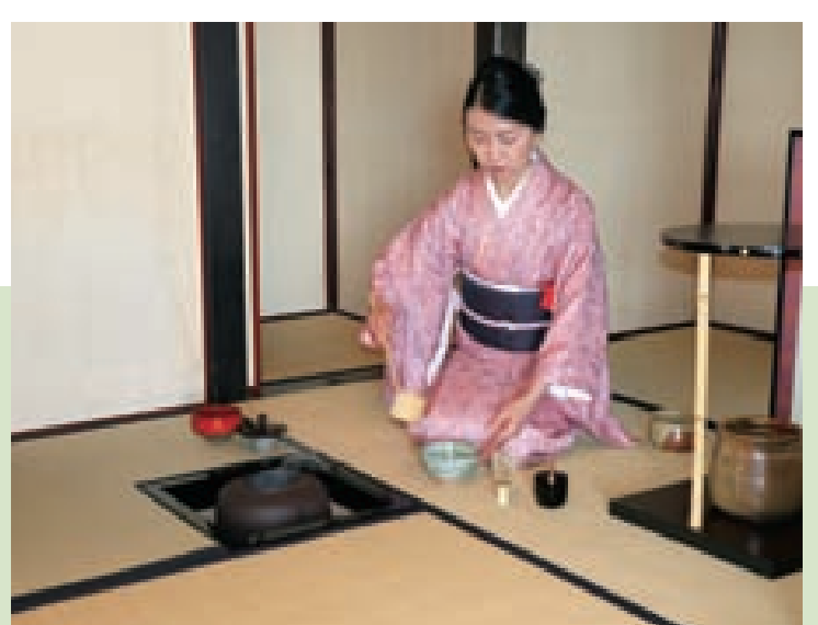
In preparing the tea, called temae , the tea master ladles hot water into a tea bowl.

zen. To finish the meal, guests enjoy Japanese wagashi confectionery, which concludes the first half of the tea ceremony. After a brief interval, the guests reenter the tea room, where tea is then prepared by their host in accordance with a set of beautifully and precisely choreographed movements called temae. Two types of matcha are prepared: a thick version called koicha , followed by the lighter usucha. The formal tea ceremony ends here. More popular, simplified tea ceremonies may offer only usucha and wagashi; these are usually held in a large room where many guests can be accommodated.