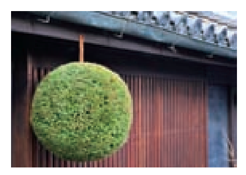
A ball of fresh cedar leaves hangs outside a sake store.

There are some 1,400 sake breweries in Japan today, ranging from large-scale companies to small artisanal makers, and together, they produce over 10,000 brands of sake. This number reflects the country's many regions that boast the essential ingredients needed to brew superior sake: pure spring water, outstanding locally grown sake rice, and special koji (Aspergillus oryzae). Sake is brewed by adding koji mold to steamed rice, resulting in a fermentation process that converts the rice starch to sugar. Moto yeast, also known as shubo, or "mother of sake," is added to induce alcoholic fermentation of the sugar.