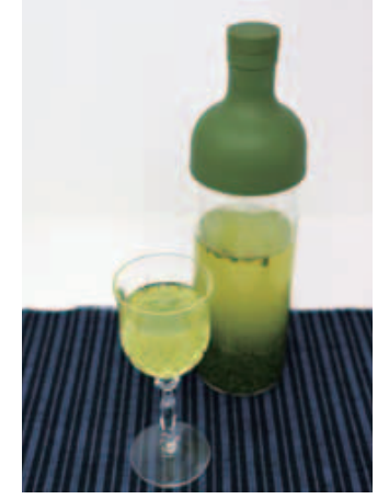
The beautiful green color and delicate aroma of cold-brewed sencha can be fully appreciated when served in a wine glass.

people, about two teaspoonsthree or four grams, about 0.10 to 0.14 ounces—of leaves are recommended. Ideally, the water should be between 55-60°C (130-140°F) and the leaves steeped for about one minute before serving; or, in the case of fukamushi deepsteamed sencha , for about thirty seconds. Water that is too hot increases the astringency and bitterness of tea; water at lower temperatures of 70-80°C (160-180°F) produces a sweeter, more mellow tea with a higher amount of umami. Hojicha and bancha teas may be steeped in slightly hotter water of 95-100°C (200-212°F) and poured after brewing for around thirty seconds so as to appreciate their unique aromas. When serving, the