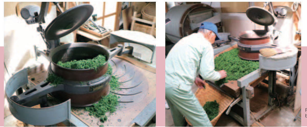
Rolling tea leaves by machine

people, about two teaspoonsthree or four grams, about 0.10 to 0.14 ounces—of leaves are recommended. Ideally, the water should be between 55-60°C (130-140°F) and the leaves steeped for about one minute before serving; or, in the case of fukamushi deepsteamed sencha , for about thirty seconds. Water that is too hot increases the astringency and bitterness of tea; water at lower temperatures of 70-80°C (160-180°F) produces a sweeter, more mellow tea with a higher amount of umami. Hojicha and bancha teas may be steeped in slightly hotter water of 95-100°C (200-212°F) and poured after brewing for around thirty seconds so as to appreciate their unique aromas. When serving, the