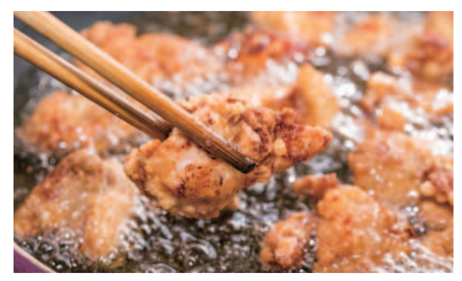
Deep-frying chicken karaage

CLOSE-UP JAPAN Traditions and trends in Japanese food culture