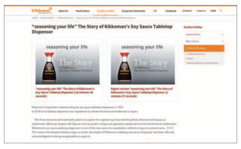
Kikkoman website presents the video "seasoning your life" The Story of Kikkoman's Soy Sauce Tabletop Dispenser. www.kikkoman.com/en/quality/ip/topics4.html

In January 2020, the Kikkoman website released the video, "seasoning your life" The Story of Kikkoman's Soy Sauce Tabletop Dispenser, which tells how its iconic glass dispenser, first introduced in 1961, was developed. The fundamental design objective was to craft a dispenser that would be regarded as essential tableware—in the same category as a plate or teacup, as opposed to producing a mere container.