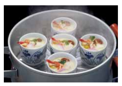
Steaming cups of chawan-mushi

long history. Nagasaki's tojin yashiki compound, built for Chinese merchants in the seventeenth century during the period of Japan's self-imposed isolation, was a source of cultural and culinary influence. The origins of chawanmushi emerged during the eighteenth century, and can be traced to Nagasaki's Shippoku banquet cuisine, consisting of an abundant array of both Chinese and Western foods. Chawanmushi is both delicious and versatile: nowadays, it not only appears in kaisekiryori, Japanese haute cuisine, but is also made and enjoyed at home.