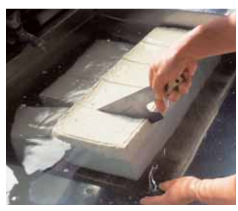
Cutting tofu into blocks

Tofu, high in protein, is popular around the world; in Japan, Kyoto is known to be the best source for delicious tofu. Sovbeans are farmed in this region, but the main reason is its water: tofu is made with soybeans, but is 90% water. Green and mountainous, the area around Kyoto is blessed with high quality soft water. Tofu was introduced to Japan from China in the seventh and eighth centuries, after Buddhism arrived from the continent; it was not until the fourteenth century, however, that tofu