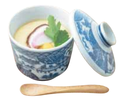
In the past, chopsticks were used; today it is usually eaten with a spoon.