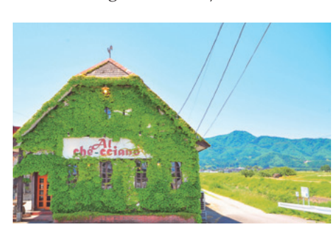
Al-ché-cciano in Tsuruoka, Yamagata Prefecture

Influenced by the emergence of nouvelle cuisine in France around this time, Italian chef Gualtiero Marchesi led the nuova cucina movement, which favored the proper heating of ingredients to enhance their flavors, the use of light and subtle seasonings, and an attention to the colors of ingredients. In Japan, prosperity during the second half of the 1980s fueled a boom in the popularity of Italian cuisine, and Japanese chefs exposed to the nuova cucina movement in Italy began to devise new styles of Italian food, unconstrained by tradition. The breakdown and reconstruction of traditional Italian cuisine and the search for lighter flavors, as well as