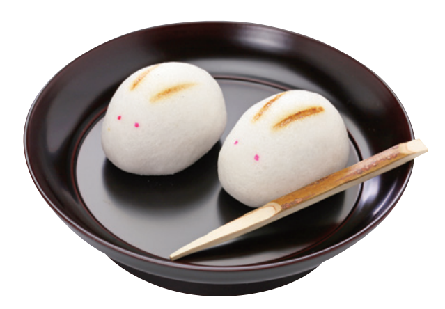
Kansai-style oval tsukimi-dango wrapped in sweetened azuki bean paste; bunny-shaped manju buns.