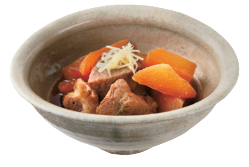
Parboiled daikon and pork simmered in dashi, soy sauce and other seasonings