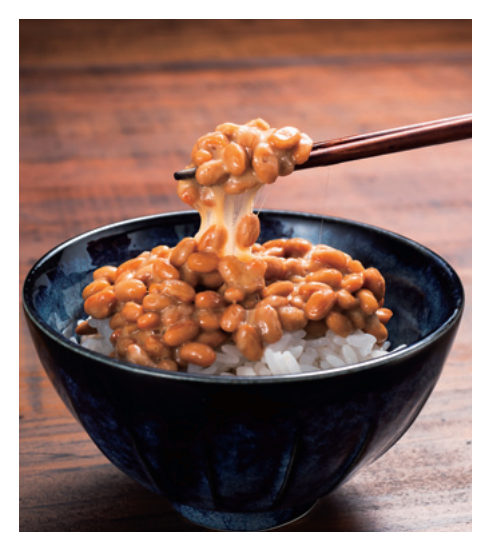
Natto fermented soybeans

of stickiness, expressed as neba neba , found in foods like okra, natto fermented soybeans, mozuku seaweed and tororo grated mountain yam. Mochi glutinous rice cakes have long been offered to the gods during the New Year, and eating them is a custom that embodies an