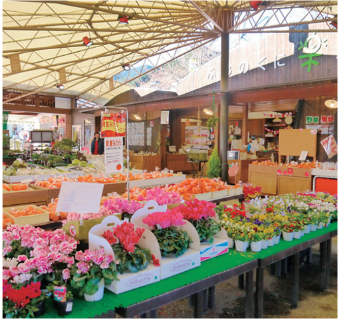
Farmers market (above) at Fujikawa-Rakuza At left, Kariya Highway Oasis souvenir shop