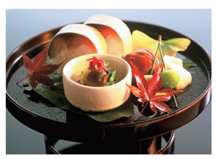
Autumn hassun at Kinobu: Elements of food and nature harmonize in elegant expression of the season. Decorative autumnal leaves and pine needles evoke the essence of autumn; from the sea comes mackerel sushi, and mountain delicacies include sweet simmered chestnuts and grilled gingko nuts.

and came to be nurtured, but according to Japanese historian and academic Isao Kumakura, its traces can be found in various expressions of art and culture throughout history.2 For example, a traditional aesthetic concept called yugen, used to describe a