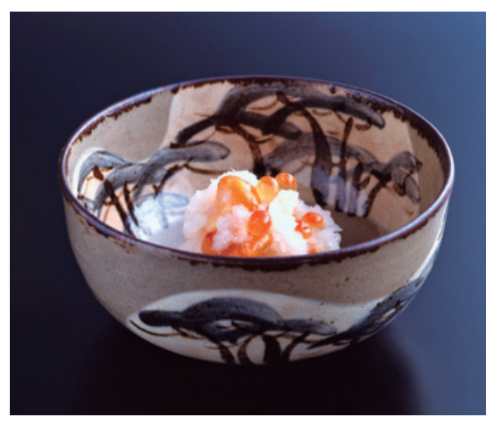
Salmon roe and nametake mushrooms with grated daikon, served in tea bowl with pine motif by ceramic artist Kenzan Ogata.

"subtle profundity," was expressed in the performance of Noh drama in the fifteenth century. Another aesthetic notion, often conveyed in the sixteenth century, is wabisabi, the "sense of fulfillment found in solitude and loneliness felt after passing through the best days of life." This philosophical concept is most deeply rooted and imparted through the Japanese tea ceremony (chanoyu). And the elegant paintings of the Rimpa School, prominent during the