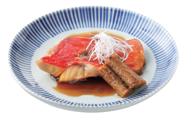
Simmered kinmedai and burdock seasoned with soy sauce, mirin, sake and sugar, garnished with shredded Japanese long onion