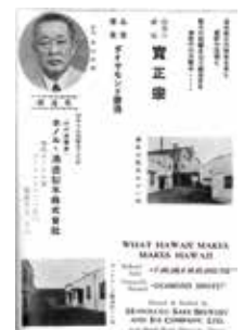
Photo 14 Diamond Shoyu Address Directory of Japanese Americans in the U.S., 1949