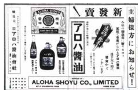
Photo 12 Aloha Shoyu Hawaii Times, Dec. 7, 1946