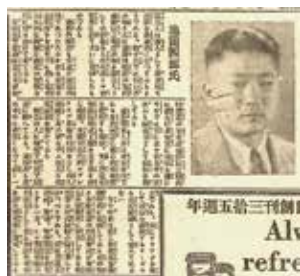
Photo 15 Ikeda Shoyu Hawaii Mainichi, July 17, 1941