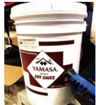
Photo 21 Five-gallon soy sauce container for commercial use