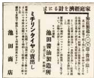
Photo 16 Ikeda Shoyu Hawaii Mainichi, Jan. 19, 1923