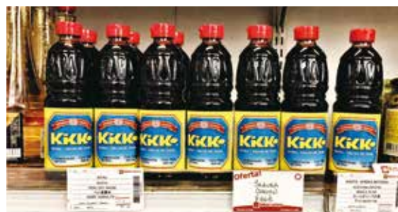
Photo 3 Made-in-Peru soy sauce sold in Japan in Aikawa-machi, Kanagawa Prefecture

A great many Latin Americans, including Japanese Brazilians, are now in Japan working as dekasegi or migrant workers. They did not necessarily come for financial reasons. Many have come for study or intercultural experiences, and many have settled in as permanent residents. Some of these Japanese Brazilians say they still prefer the soy sauce they were familiar with at home to that sold in Japan, although they use the latter because they live in Japan. This is understandable, since a dietary lifestyle is something people get used to. The same thing can be said about Peruvians. Soy sauce made by Nikkeijin in Peru is sent to Japan and sold to Peruvians living in Japan (Photo 3).