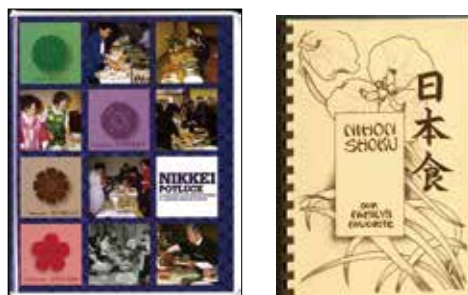
Photo 2 Recipe books published in Nikkei communities

the usual ingredients or materials, and how the contents of their diet transformed across the generations. The third lecture was titled Recipe Books and Nikkeijin which was based on recipe books and cookbooks I acquired that had been published in the Nikkei communities in the Americas (Photo 2). In line with the themes of previous lectures, the fourth was titled Made-in-Brazil Soy Sauce: The Birth and Potential of Japanese-Brazilian Soy Sauce. At least six to ten soy sauce companies of Japanese descent appear to remain in business in Brazil. I carried out research to record their history.