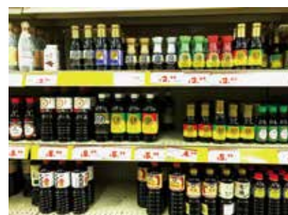
Photo 7 Shelves at Foodland