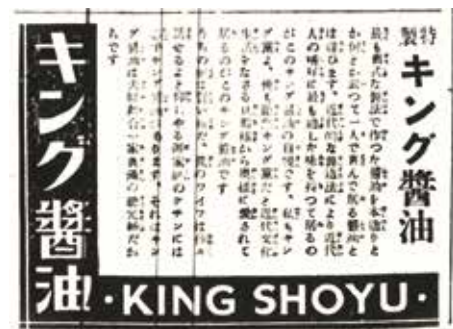
Photo 11 King Shoyu Hawaii Times, July 10, 1947