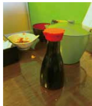
Photo 20 Soy sauce dispenser

During a field study in 2023, soy sauce bottles or dispensers with brand names on them were not seen on the tables of any restaurant. Instead, most restaurants had store-bought soy sauce dispensers that had been filled with sauce from the original container ( Photo 20 ). One of the restaurants visited had a large 5-gallon commercial-use container of Yamasa soy sauce in the kitchen ( Photo 21 ). In restaurants in Brazil, soy sauce on restaurant tables is still in bottles as sold at supermarkets. In restaurants in Hawaii, soy sauce bottles with brand names on them are not seen, and we could not determine the soy sauce brand without asking the staff.