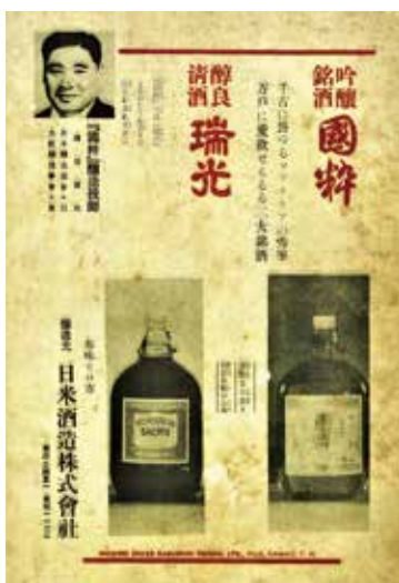
Photo 17 Kokusui Shoyu Hawaii Island Guidebook, 1954