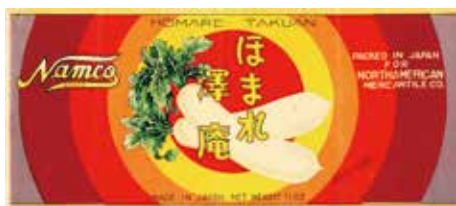
Photo 1 Label from canned takuan , 1935 Namco A label from a can sold at a Yorozu-ya in North America A variety of foods have been canned and imported for over 100 years.

So far, I have given four lectures for the Food Culture Seminar. The first was The World of Yorozu-ya . Yorozu-ya refers to a general store where people of Japanese descent overseas import and sell Japanese foods and other merchandise (Photo 1). For the second lecture, Transitions of Japanese Cuisine, I talked about how Japanese immigrants prepared Japanese dishes when they lacked