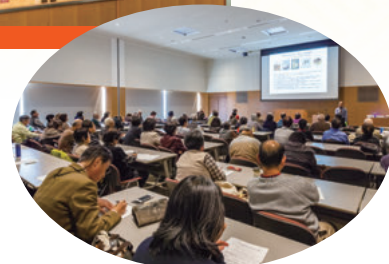
Food culture seminar