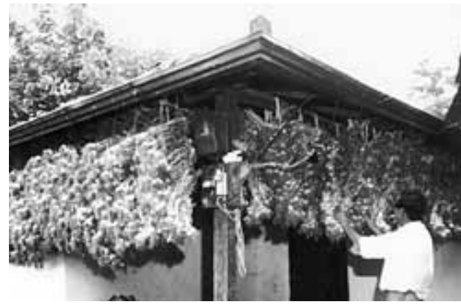
Garlic being hung for drying

Another aspect which lends depth to the flavors of kimchee is the variety of salt. Surrounded by the sea on three sides, the cuisine of the Korean peninsula includes a variety of salted fish organs. As a food which is preserved in large quantities, it is often mixed with pickled vegetables. The Capsaisin found in red pepper is thought to be the ingredient which made the combination of vegetable pickles and animal-product pickles possible. Salted fish organs contain fat. Capsaisin, however, prevents those fats from spoiling when the foods are kept for a period of time. Therefore, the inclusion of salted fish organs in pickled dishes adds to the variety of kimchee