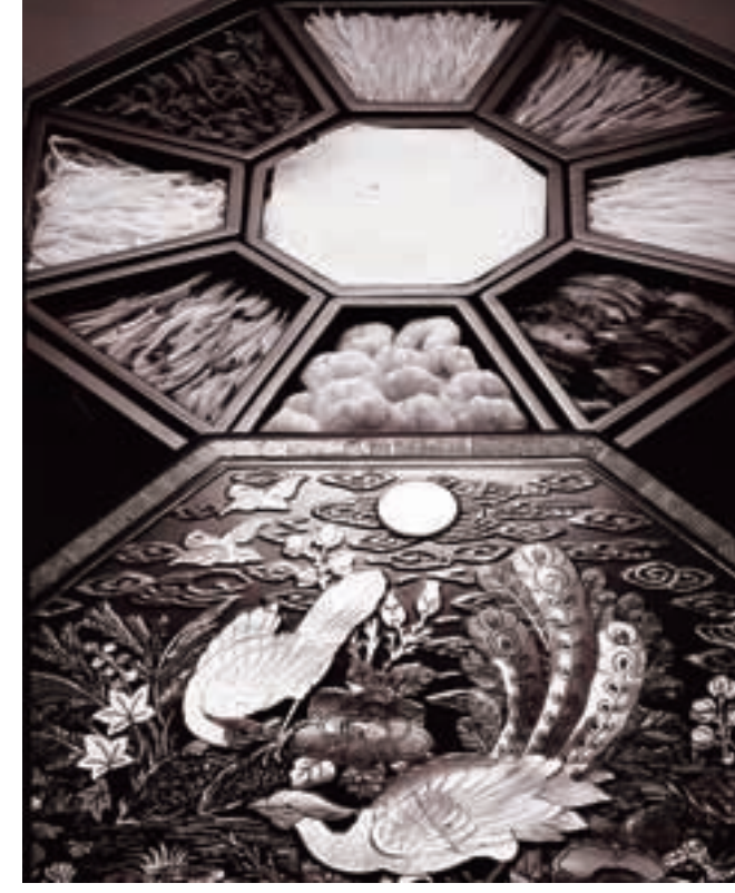
Kujorupan (an imperial dish)

Another popular dish in Korea is called kujorupan (see photo). Known as an imperial dish of the Choson Dynasty, nine separate ingredients are presented. Served from an eight-sided, nine-sectioned serving dish with an eight-sided space in the center where white, crepe-like wrappers are placed. Within each of the other eight sections are placed single ingredients, each either green, red, yellow, or black. This dish is eaten by placing a small amount of each item from the eight surrounding sections on a crepe (made of a thinlyfried wheat mixture) from the center section, and then wrapping up