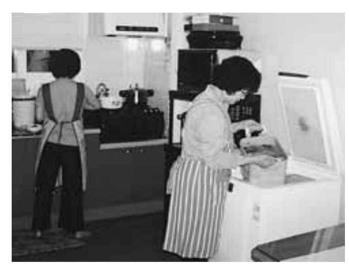
The necessary aging of kimchee (kimchee stocker)

With the beginning of the fifteenth century, the Choson Dynasty blossomed as a Confucian culture. However, simply because eating meat was permissible for the public does not mean it was always eaten. Rather, as meat was a valuable asset, it became a high-class food. As a valuable commodity, the wise use of meat in ways in which it would not be wasted was developed. Techniques for utilizing every part of the cow or pig, from head to hoof, were developed for cooking. A wide range of cooking techniques such as boiling, grilling, steaming, drying, pickling, and the serving of raw dishes were also developed. The items to be found in today's yakiniku (grilled meat) restaurants are the accumulation of techniques developed since the Choson Dynasty, and can be found nowhere else. We must realize that the deep influence of the Confucian lifestyle shows its affect on even a single meat dish.