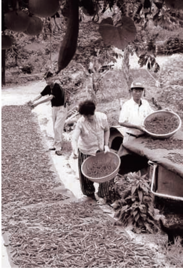
Autumn in Korea...Harvesting and sun-drying red peppers

Buddhism first spread to the Korean peninsula in the fourth century. Before Buddhism took hold, Koreans enjoyed eating meat, and livestock was a valuable asset. With the spread of Buddhism, the killing of animals, and therefore the eating of meat, was strictly forbidden. By the second half of the sixth century, Buddhism had become the state religion of the entire Korean peninsula, and the eating of meat was minimal. This near vegetarian diet continued through the first half of the thirteenth century. This food culture was changed