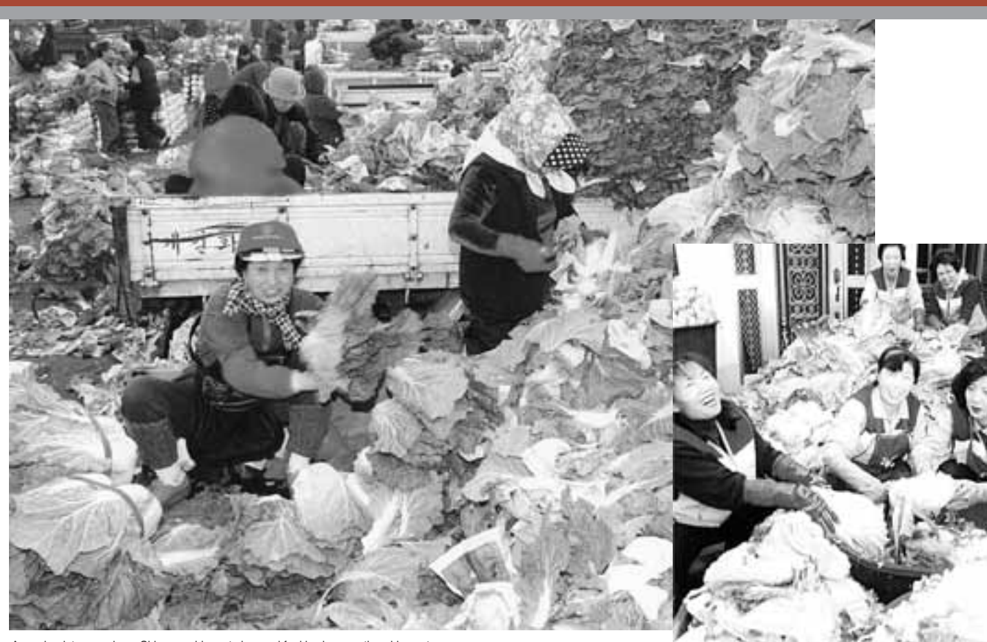
An early winter morning... Chinese cabbage to be used for kimchee awating shipment

Spiciness and saltiness combine to make a good balance. With the use of hot spices, a salty flavor becomes milder. Since spiciness tends to be more noticeable than saltiness, we notice the salty flavor less and the typically simple flavor of pickled dishes broadens into a complex combination of flavors. A decrease in the amount of salt with an increase in the flavor of pickled dishes was made possible by the introduction of red pepper.