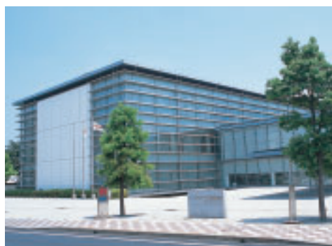
The buildings of Kikkoman's Noda headquarters harmonize nicely with the surrounding neighborhood