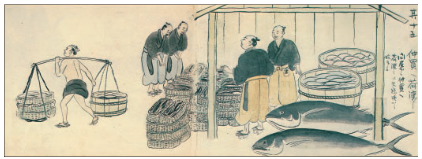
Wholesalers handed fish over to brokers without fixed prices. The two men bowing are brokers. The man at far left is a fish vendor. All fish vendors of the Edo period carried fish in this manner. (Property of the Wholesales Co-operative of Tokyo Fish Market)

wholesale shops carried out a vigorous trade throughout the Uogashi, collecting a tremendous amount of money every morning.