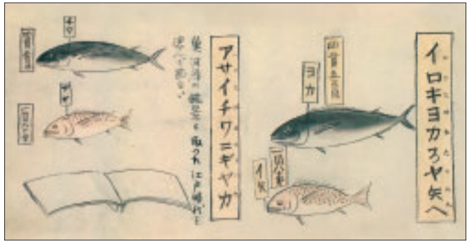
Price codes used in the Uogashi. Nine auspicious characters were used instead of the numbers 1 through 9.

tubs. Some say he has another business on the side. Weaving his way through the crowd, Jirokichi slips into the Uogashi through a black gate. Let's follow him to get a glimpse of morning trading at the Nihonbashi Uogashi.