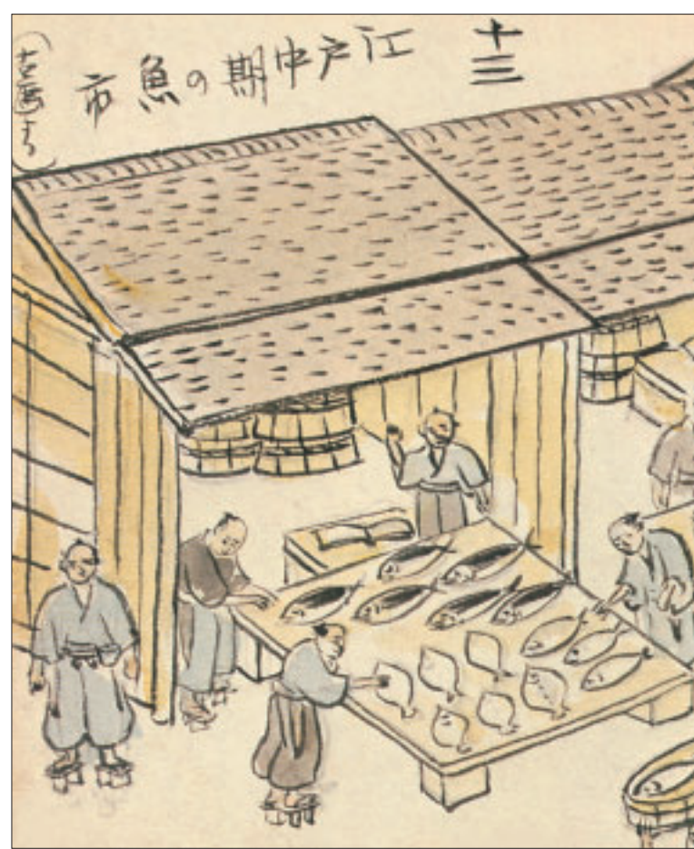
Horeki era (1751—1764) fish market. A row of simple fish shops with their fish displayed on itabune .

The primary function of the Uogashi, that of supplying fish to the shogunate, had become quite a burden. As the price of fish escalated, wholesalers secretly schemed to sell their best fish at high prices in the market, and to deliver somewhat lower