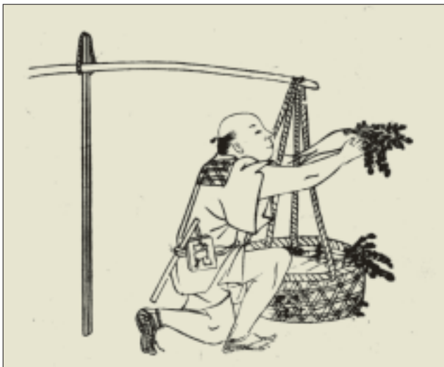
Vegetable peddler (Shokunin Uta-awase, property of Tokyo Kasei-Gakuin University Library)