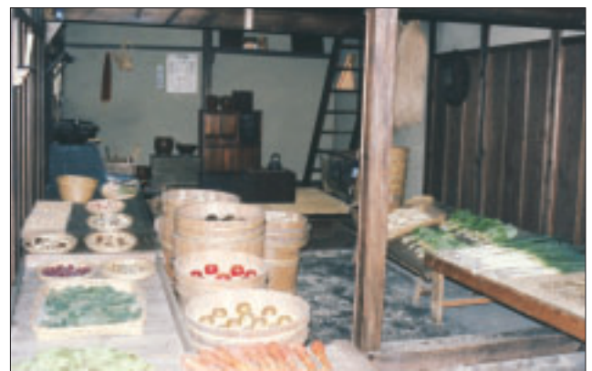
Reproduction of a greengrocer