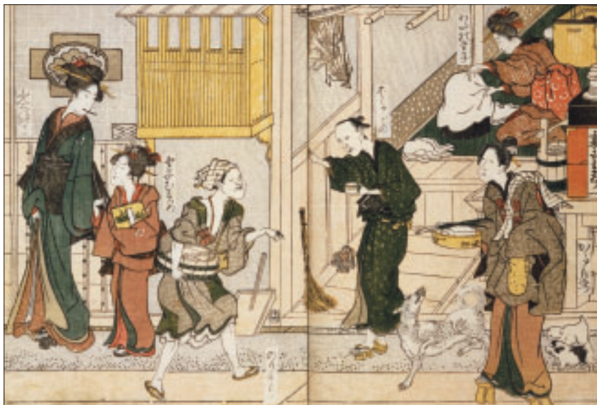
Backstreet rowhouse ( Ehon Imayo-sugata by Utagawa Toyokuni, presumably published around the Kansei era, 1789–1800; property of Edo-Tokyo Museum, reproduced for use here from an image in the Tokyo Foundation for History and Culture image archives)

Part 3 of this series looked at the lives and work of Edo rowhouse dwellers, focusing primarily on the role of vegetables in their diet. Ordinary meals generally consisted of white rice, soup, a side dish and pickles. Stewed dishes made from vegetables such as eggplant