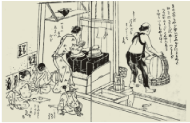
Children eating rice and sweet potato porridge in a rowhouse kitchen. This sketch, from a book published during the Great Tenpo famine, illustrates a common rowhouse kitchen. ( Nichiyo Joshoku Kamado no Nigiwai , property of Tokyo Kasei-Gakuin University Library)

about the earnings of carpenters and laborers. As carpenters and laborers earned 300–500 mon (the standard currency of the time) and 280 mon per day respectively, a peddler in the late Edo period presumably earned around 200–300 mon per day.