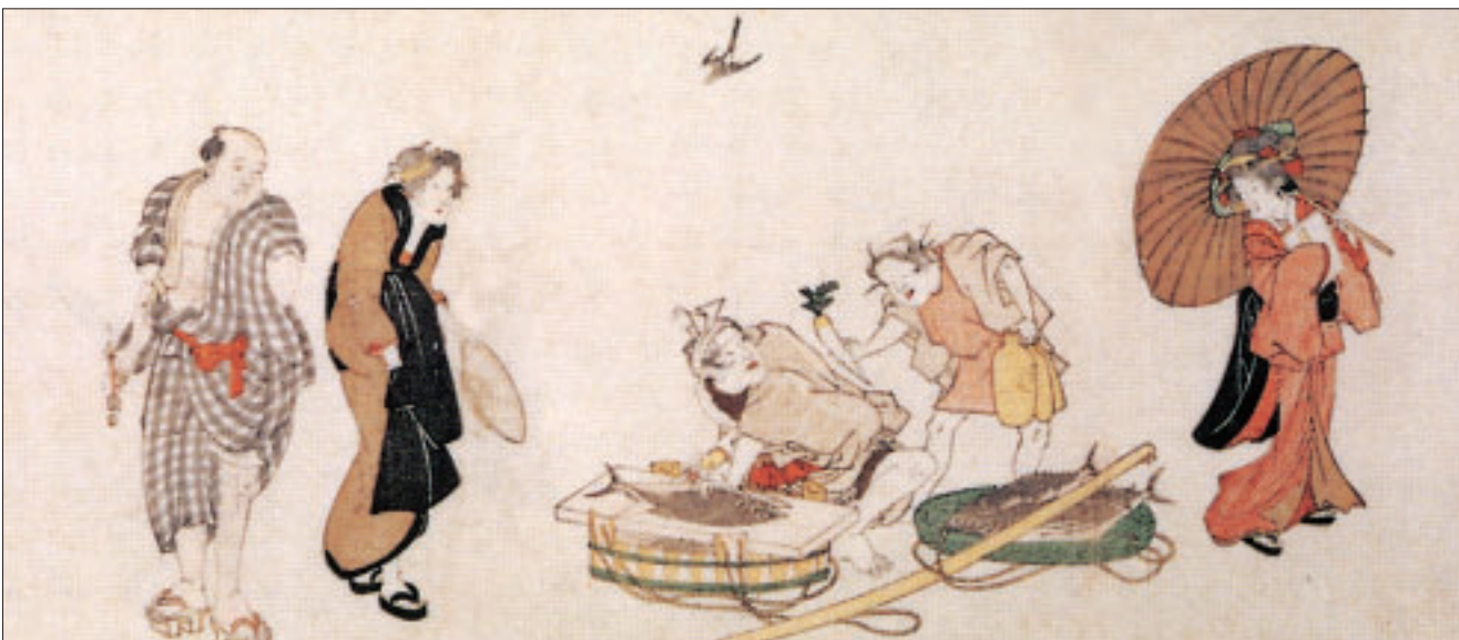
Just as with fish, Edo people placed great value on the first vegetable products of the season. Bans on the early sale of fish and vegetables were frequently imposed but rarely observed.

While the meals of the upper classes, especially those served on special occasions, were often recorded, there are very few records that tell us about the meals of the common people. Therefore, we refer to essays and stories published near the end of the Edo period, as