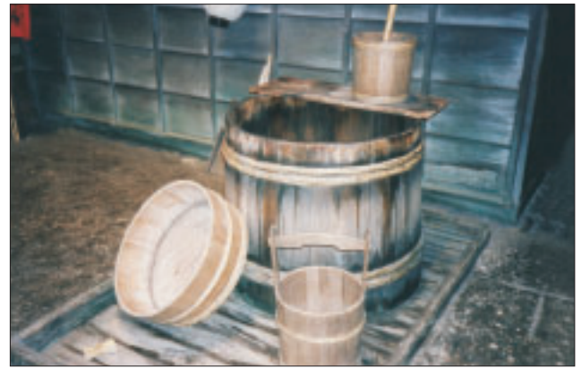
Reproduction of a communal well

There are no records clearly indicating the daily income of peddlers. Therefore, we attempt to infer this information from data included in Morisada Manko