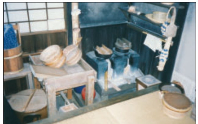
Reproduction of an Edo-period rowhouse kitchen. The wooden sink, stove and water pot were essentials.