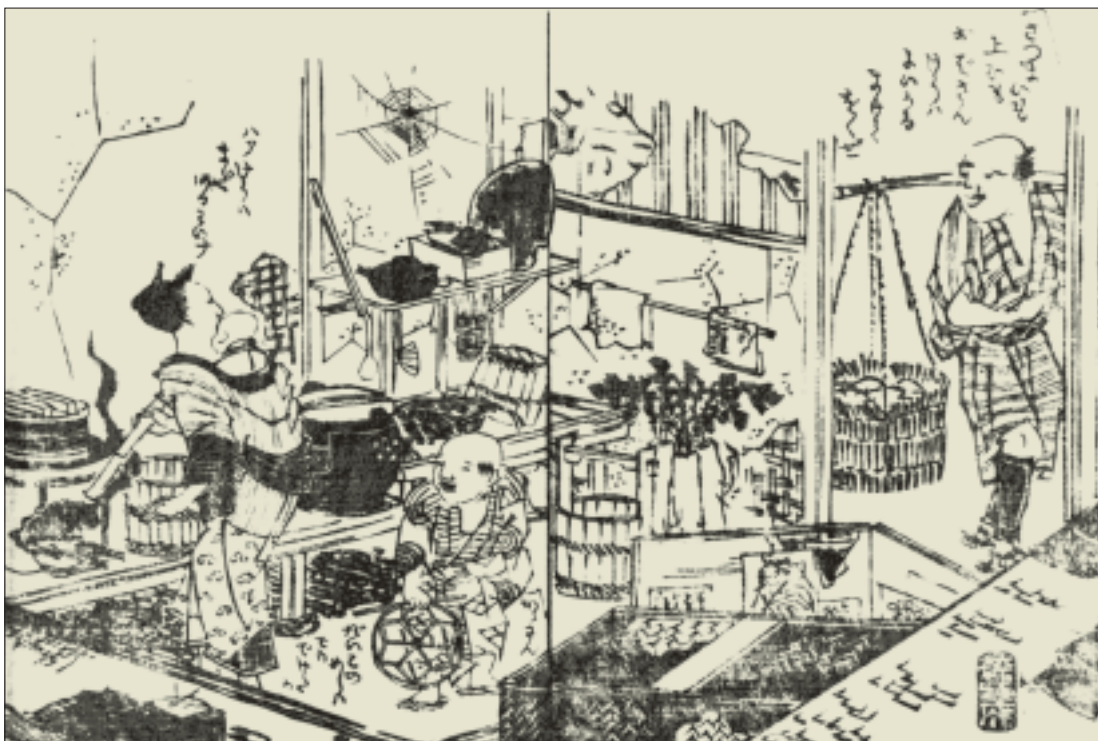
Rowhouse kitchen (Tohi Anitsu-den, property of Tokyo Kasei-Gakuin University Library)

The man also talks about tofu, which, according to Morisada Manko, was sold in much larger blocks in