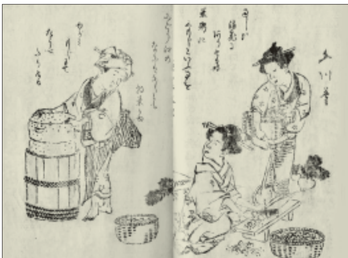
Making pickles from daikon radish ( Tsukemono Shio-kagen , property of the author)

of soybeans. The ordinance issued by the magistrate standardized the size of a block of tofu at a ninth of a full slab of tofu made from 7.2 liters of soybeans. The dimensions of a block remained unchanged at approximately 21×18×6 cm. A harder tofu made from roughly 8.66 liters of soybeans, with each block cut into twelve smaller pieces, became the standard