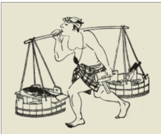
Fish peddler (Shokunin Uta-awase)

well as to rakugo (the art of comical storytelling that became very popular during the late Edo period), to get an idea of the diet of Edo's common townspeople. Morisada Manko indicates that by the end of the Edo period, the meals of those living in Edo and those living in the Kyoto-Osaka region had become somewhat different. For example, while white rice, only cooked once a day to save firewood, was the primary staple in both areas, freshly cooked rice was served for breakfast in Edo and for lunch in the Kyoto-Osaka region. The commoners of Edo ate freshly cooked rice and miso soup, with or without a simple side dish, for breakfast, cold rice and a stewed dish for lunch, and rice with green tea poured over it and pickles for supper. In contrast, the people in Kyoto and Osaka ate freshly cooked rice, miso soup and a stewed or grilled dish for lunch, and the same rice with green tea poured over it and pickles for supper that the people of Edo ate. As rice cooked the previous day becomes quite