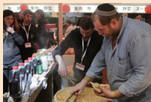
Tasting of dishes that used Kikkoman products at the reception