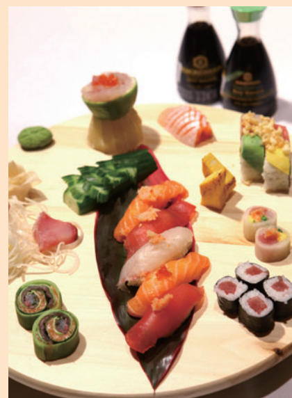
The winning sushi