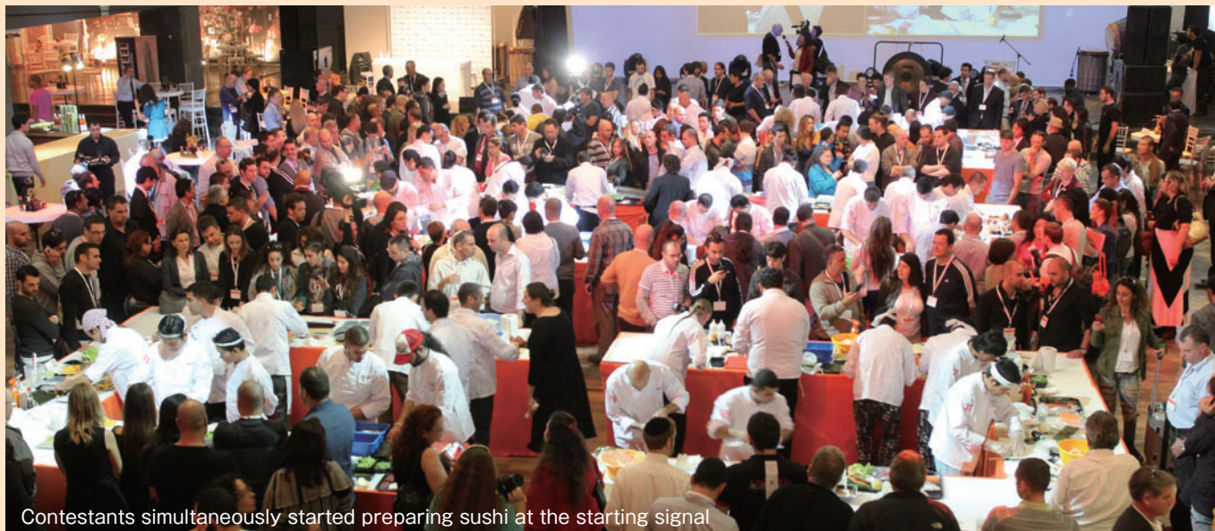
Contestants simultaneously started preparing sushi at the starting signal