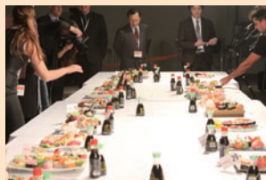
Judging in the state room